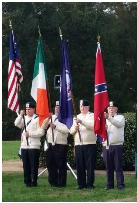
Father Corby Color Guard

Two Virginia AOH Divisions, General Thomas F. Meagher Division (Fredericksburg) and Father Corby Division (Fairfax) joined the National Park Service and the 28 th Massachusetts Infantry Regiment re-enactors in the annual ceremonies at the Fredericksburg city dock, where the brigade crossed the Rappahannock River, and at Marye's Heights.