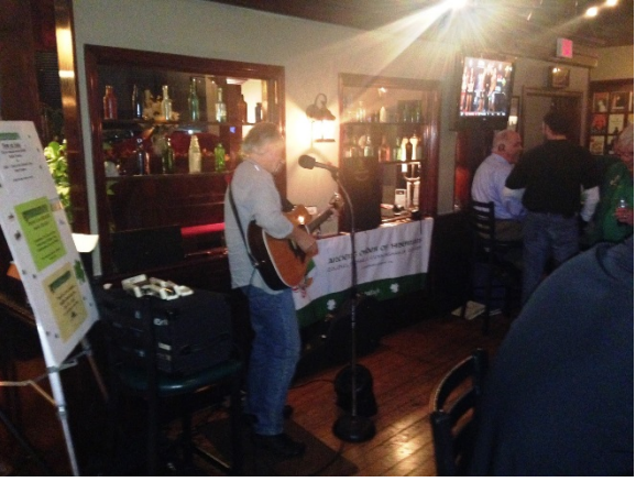
It can't be an Irish party without Irish music