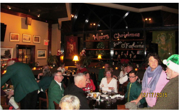
Small portion of the large group at the Christmas Party