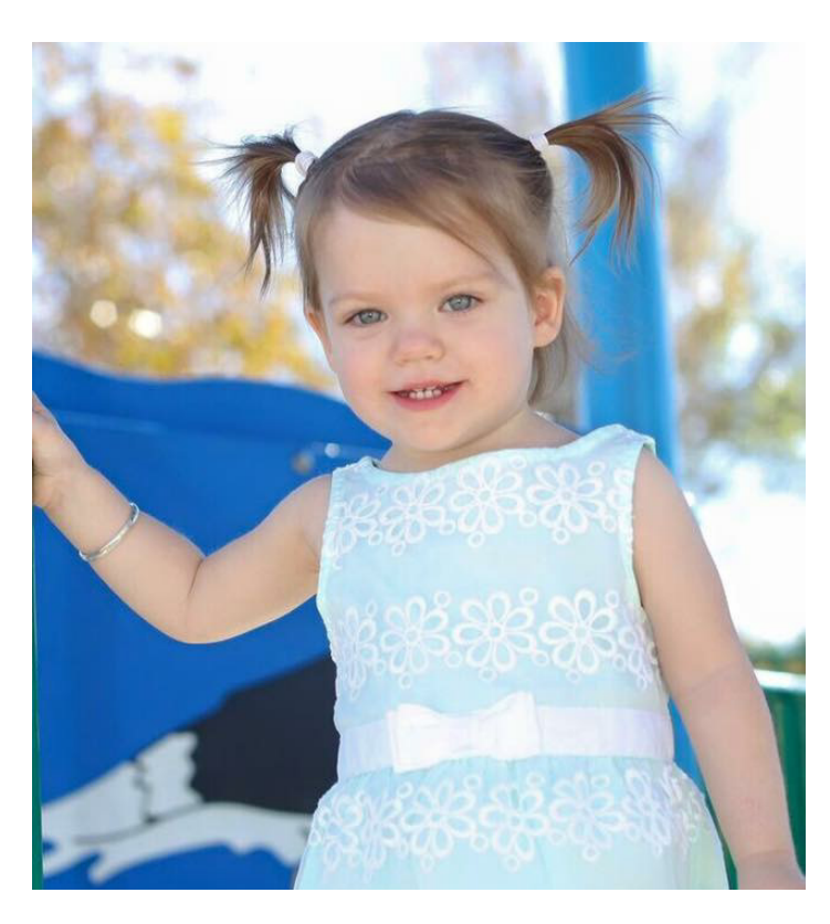
The Power of Prayer

The next Colonel Cunningham Division meeting is scheduled for Wednesday, February 10<sup>th</sup> at 7:30 PM . The meeting location is the Belmont Greene Community Center. 43003 Chesterton St., Ashburn VA 20147. All AOH Brothers are encouraged to attend our next meeting---and bring a friend. New members will be sworn in at this meeting.