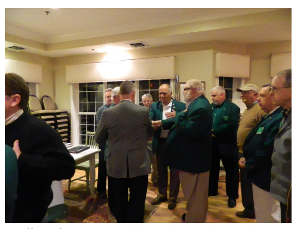
As officers form crosses, all the other members gather in a circle around them