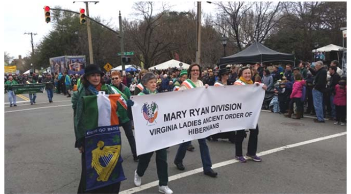
The Ladies Ancient Order of Hibernians