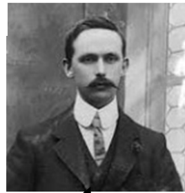
Sir Eamonn Ceannt