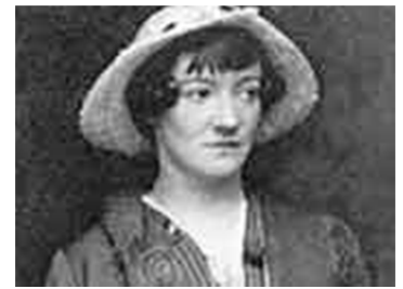
Grace Gifford Plunkett