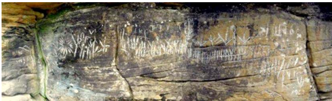
Wyoming County Petroglyph