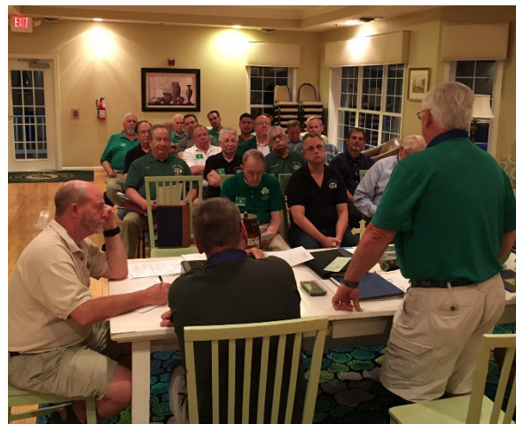
Division Brothers listen to deliberations on charity contributions.