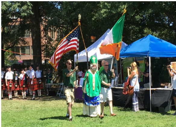
St Patrick leads the color guard to open the festival.