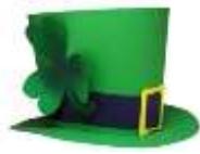
General Meagher Division Attire

In a perfect world every brother would have these articles of clothing: