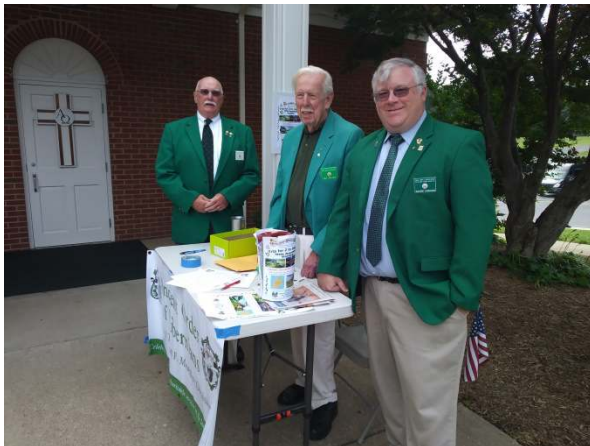
At St Patrick