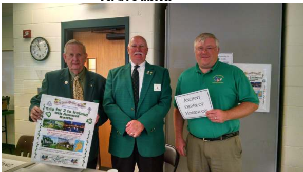
At St Matthew