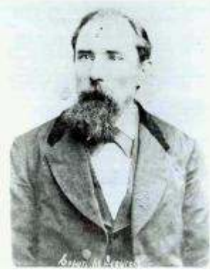
John Kehoe, "King of the Mollies," soon before his execution in 1878

The execution of the Molly Maguires helped cement Gowen's control of the anthracite-coal industry, and crushed union activity in the coal regions for close to a decade. It also won the Pinkerton Agency national celebrity. Indeed, to capitalize on the publicity, and to attract clients, Allen Pinkerton wrote Molly Maguires and the Detectives , a romanticized history of the story, which he published in 1879. The executions did not, however, intimidate workers elsewhere in the state. Less than a month after the Molly Maguires execution, the great rail strike of 1877 erupted in Pittsburgh, and then spread to rail yards across the state.