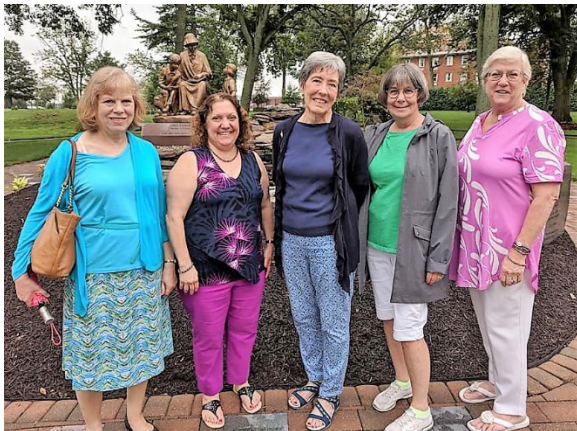
Visiting the St. Elizabeth Ann Seaton Shrine in Emmitsburg, Maryland.