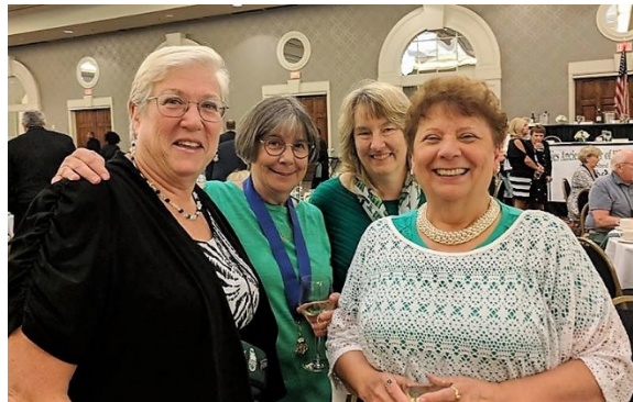
The Daughters of Erin delegates with another member of the Virginia LAOH delegation.