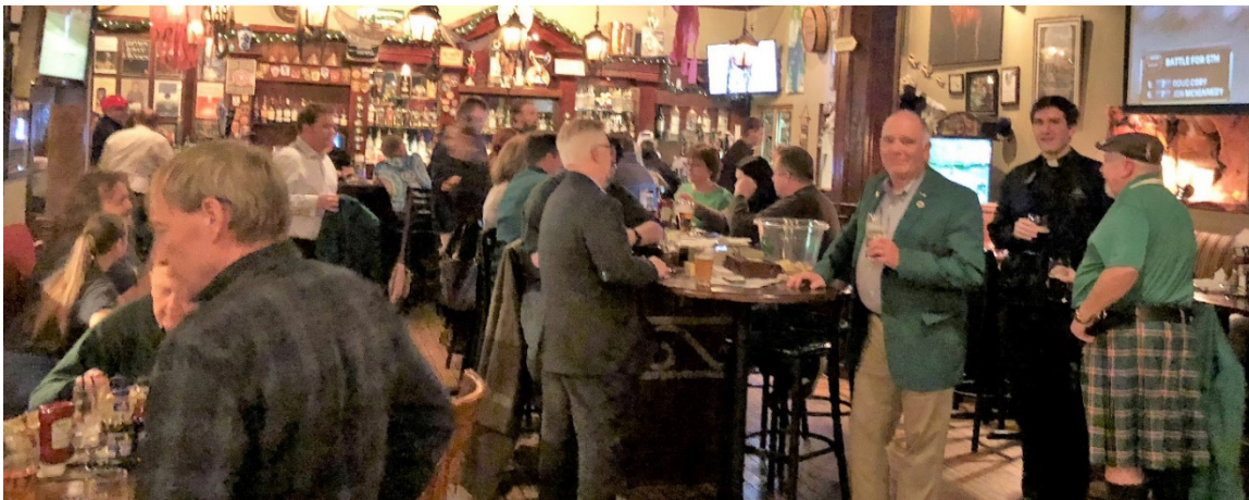
A portion of the large turnout at O'Faolain's for the Half-way Party.

The following pictures are just a few of the many attendees and highlights from this year's party.