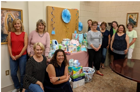
The Daughters of Erin with some of the many baby shower gifts for Birthright in Leesburg.