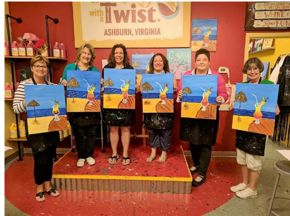
Some team building fun in Ashburn with art.