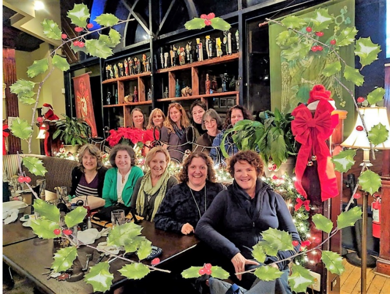
Members of the Daughters of Erin at their November meeting and social gathering at O'Faolain's Pub in Sterling.