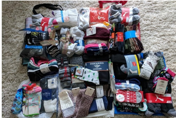
Some of the socks gathered by the Daughters of Erin for Mobile Hope.

Mobile Hope, based in Leesburg, provides services and clothing to teens and young adults who are homeless and in need in Loudoun County. The LAOH has undertaken gathering donations of socks to assist Mobile Hope in their mission of service. Socks are an extremely important item needed by many during the cold winter months.