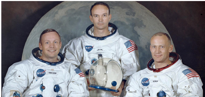
The Apollo 11 crew. From left: Neil Armstrong, Michael Collins, and Buzz Aldrin.