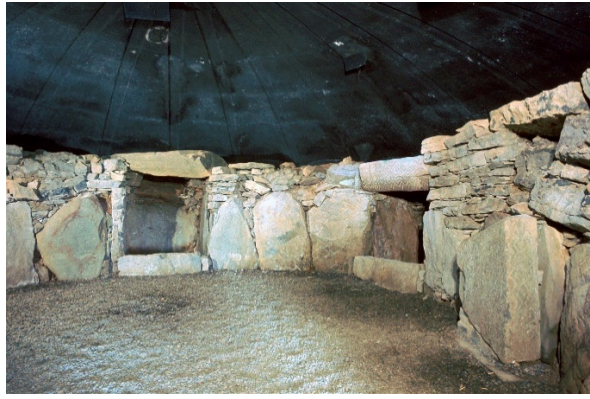
Fourknocks older than Stonehenge

Older than Stonehenge and the Pyramids, Fourknocks in Co. Meath is home to some of the most important prehistoric monuments in the world. In addition to Newgrange, Fourknocks is worth visiting. Built around 3000 BC, it has a larger chamber than Newgrange, a shorter passage, features engraved stones, and what is thought to be one of the first depictions of the human face found in prehistoric Irish art. To this see this Neolithic burial mound visitors must obtain a key from the White family, who live a mile away -- before 6pm.