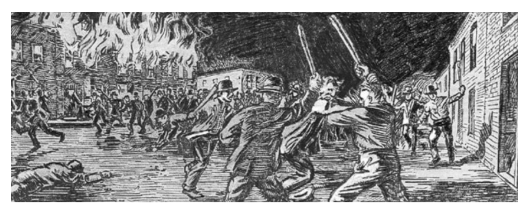
Louisville Herald Newspaper, 1922; via Bloody Monday Memorial – Ancient Order of Hibernians. (Wikipedia.)

Of all the enormities and outrages committed by the American Party (the official name for the Know-Nothings) yesterday and last night, we have not time now to write. Upon the proceedings of yesterday and last night we have no time, nor heart, now to comment. We are sickened with the very thought of the men murdered, and houses burned and pillaged, that signalized the American victory yesterday.