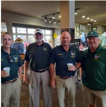
Hibernians from 3 Divisions