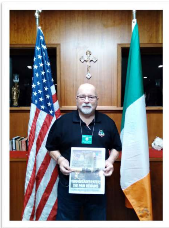
The Daily News says it best.....