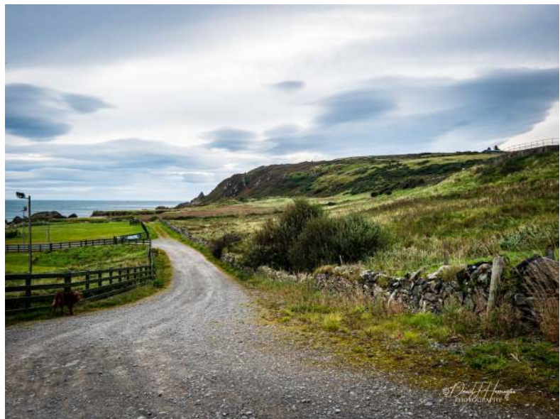
The Road to Kinnegoe Beach, Donegal

Since that time we continue to grow, adding new members and supporting and donating to Catholic schools and Churches in the area, in line with our commitment to Friendship, Unity and Christian Charity.