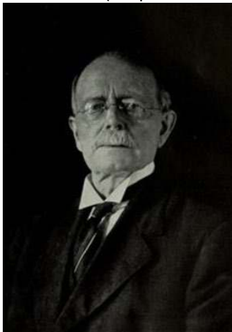
John Phillip Holland