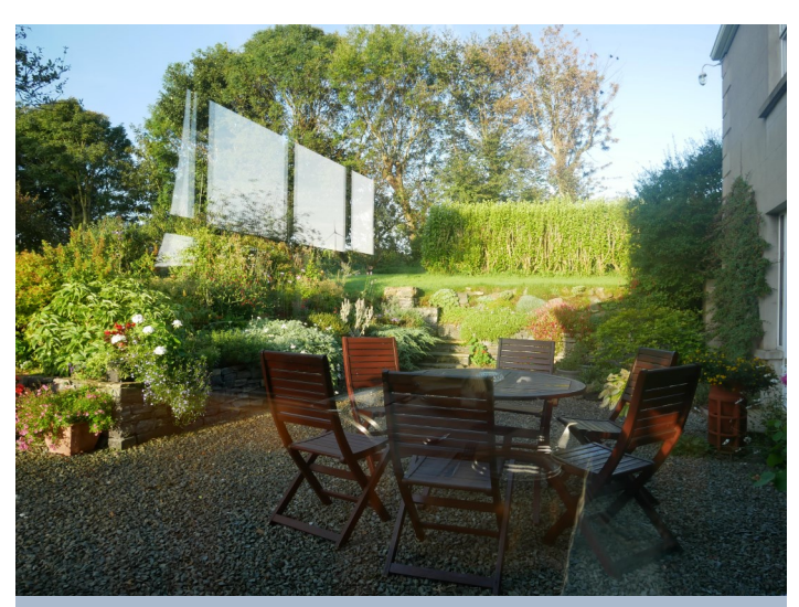
A Beautiful Evening