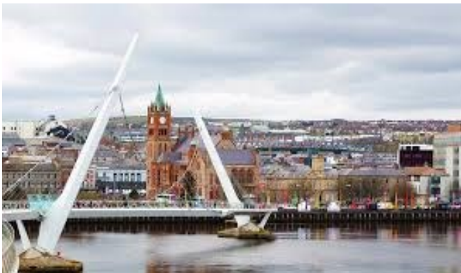
Peace Bridge Meant to connect Catholics and Protestants