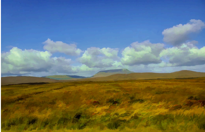
Bog Field, County Donegal, Ireland