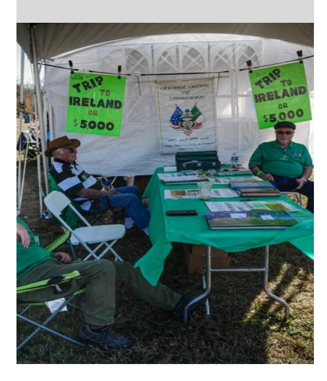
A tough day selling those raffle tickets. Time to relax!

In Italy: BOBBIO (f. 612), Taranto, Lucca, Faenza, Fiesole.