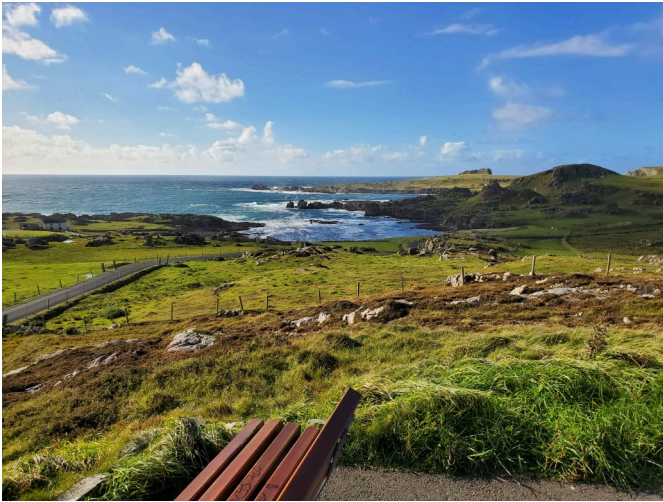
View to the west from northern Donegal