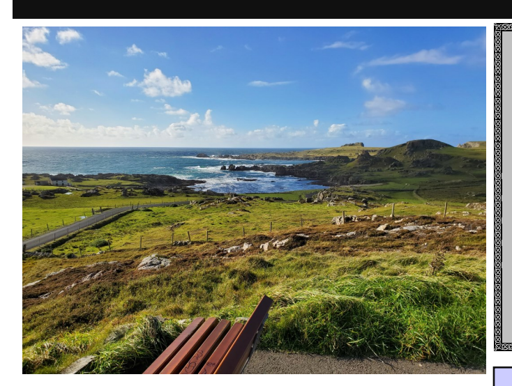
View to the west from northern Donegal