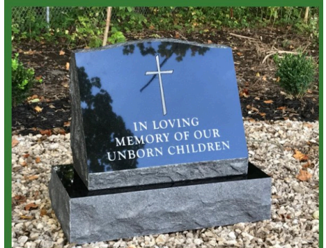
On the National Day of Remembrance for Aborted Children we visit the burial places of the unborn victims of abortion and other memorial sites dedicated to them. Join us at a prayer vigil near you.