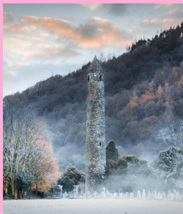
Glendalough, Co. Wicklow