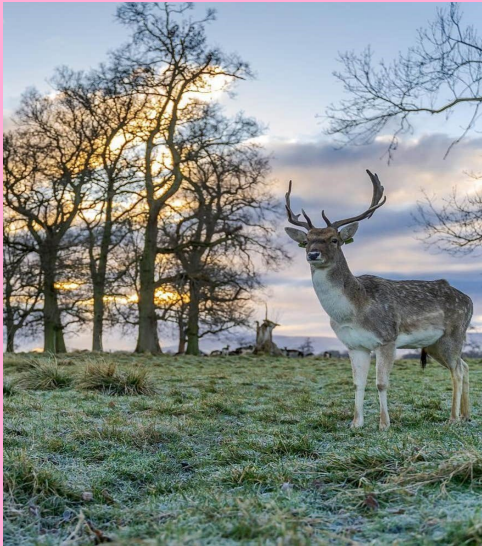
Phoenix Park, Dublin